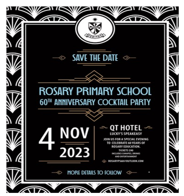
Tickets will go on sale at the end of September.

www.cgwomen.org.au to purchase tickets through Humanitix. For further information contact Samantha Hazlett at samanthahazlett@icloud.com.